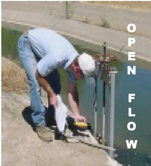
Canal Worker Recording a Flow Read-

Produce Your Own Daily Irrigation and Route Sheets